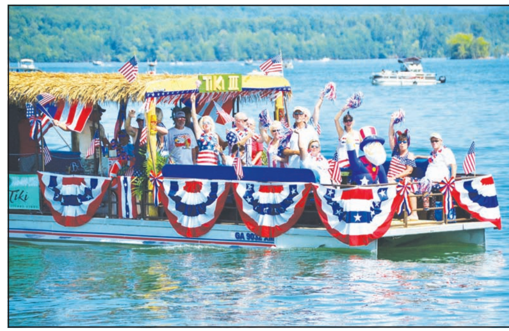
One of many patriotic boats decorated specifically for the Fourth of July Boat Parade on Lake Chatuge.

"It's also good for the See Boat Parade, Page 8A