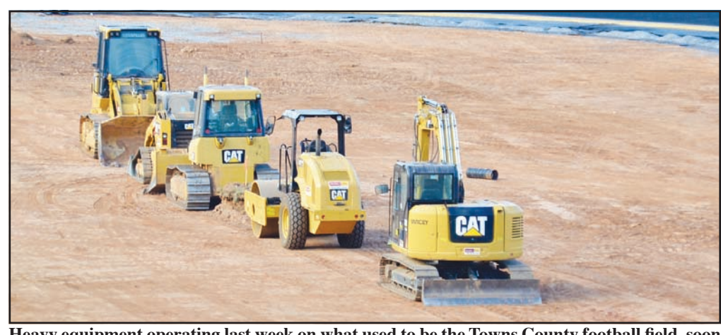
Heavy equipment operating last week on what used to be the Towns County football field, soon to be replaced with state-of-the-art artificial turf.

Stadium seating is being See Turf, Page 8A